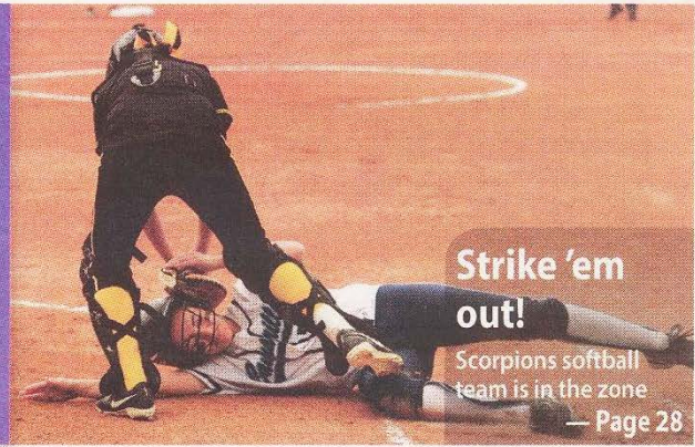
Strike 'em out!