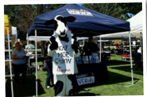
Chick fil A's cow visits the Foster VC Kids booth at the HOPE4Kids run!