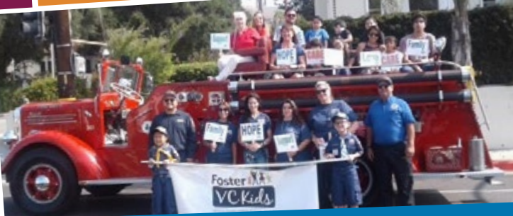
Foster VC Kids, Children's Services Auxiliary, Ventura County Fire and the Boy Scouts marched along the parade route opening up the Ventura County Fair for the 2nd year in a row!