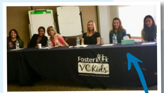
Our wonderful panel at our most recent Town Hall!

Full Life Christian Assembly in Oxnard jumped on Board in March to become a Faith in Motion partner to help spread the word about the needs of foster care within Ventura County. We are collaborating with this wonderful church to work on creating resources for youth, including tutoring and other supports. Welcome, Full Life Christian Assembly!!